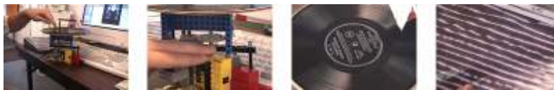
Figure 4. LEGO phonograph invented by CLL student

Limiting student expression to pencil and paper makes the demonstration of understanding difficult for many students, particularly the population of students with a history of school failure and special education classification found at the Maine Youth Center. The availability of tape recorders, digital cameras and digital video cameras made it possible for CLL students to tell the story of their learning during the project development process and when the project was completed. This served as evidence of concept mastery and understanding. Anyone who witnesses the video of a thirteen year-old student explaining his invention that graphs fluctuations in temperature over a period of several days or the student who constructed a working phonograph entirely out of LEGO, a paper cone and a sewing needle. Not only was he able to understand gear ratios sufficiently to get LEGO geared to 37 1/2 RPM (the goal was 33 1/3), but he also used a digital microscope to explain the way in which the cone amplifies the sounds generated when the needle vibrates in the grooves on the record. (Figure 4) Not only did this student recreate the historic work of Edison within a few days of entering the CLL, he demonstrated an understanding of gears, ratios, the use of a microscope, Logo programming and innumerable other concepts.