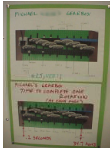
Figure 1. Student documentation of experience with gear ratios