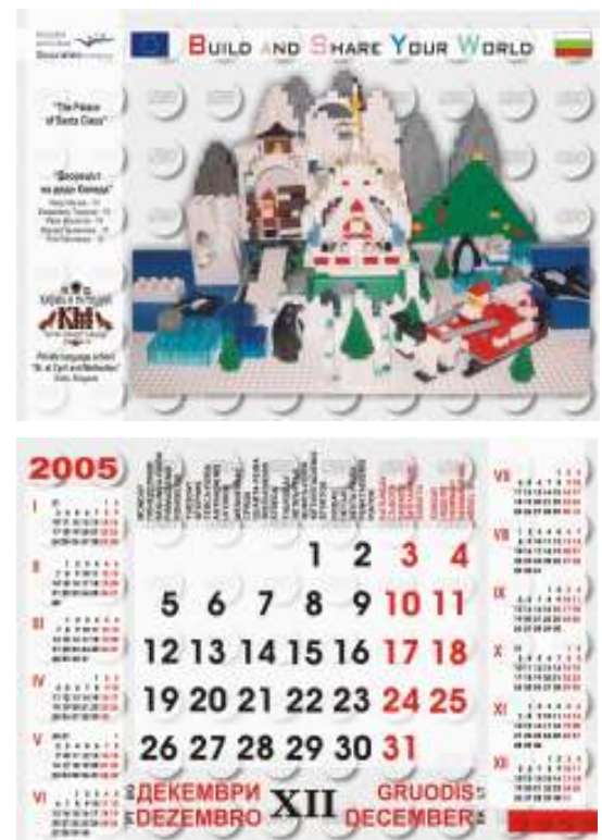
Figure 5. Calendar

While working on the project, the pupils learned more about Lego construction materials and different tools and techniques that can be used when designing models of real objects. They gained knowledge and such skills as utilising modern information technologies for creating multimedia projects.