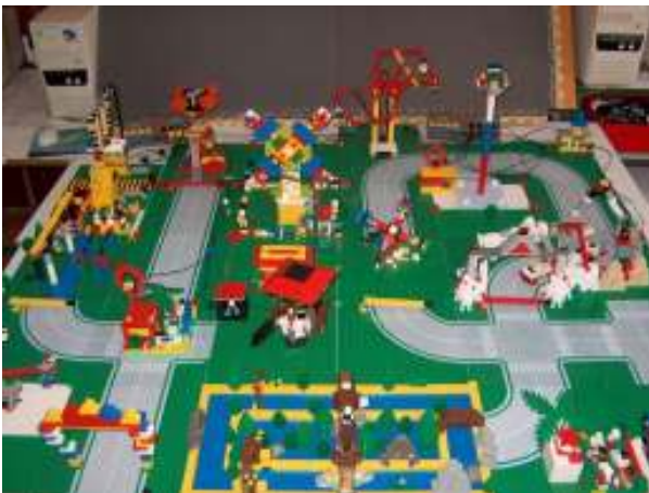
Figure 3. SofiaLand (BG, 10 y. o. students)

During the second year, the tasks for the children became more complex. They had to work on thematic projects in which some of the models were controlled by a computer, for example green house (Fig. 4); disco bar; Luna Park (Fig. 3) etc. These models were controlled by commands in Logo style. Such assignments helped the children to understand the mechanisms of the functioning of the models.