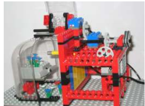
Figure 4. Greenhouse (SK, 12 y. o. students)

During the third year of the project, the children used Lego Studio to make photos and movies of their models. They created scenarios, built decorates and actors using Lego materials.