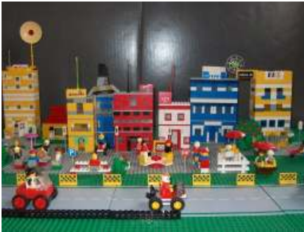
Figure 1. Our street (BG, 8 y. o. students)

During the first year , the children were creating models on different themes such as my room, my home, my school, my street (Fig. 1), my town etc. Thus, they managed to learn how to create the environment in which they can materialize their own imaginations and ideas.