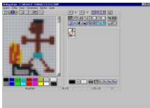
Fig. 1 –Screen of the pattern created by a student in the Megapaint

The challenge was each student create its own pattern, using as tool Megalogo software. They had created the model in the Megapaint, with subject folklore. Later they used the command REPEAT to make a screen all printed with this figure. We took the advantage to initiate the notion of multiplication from the repetition of more concrete figures. Finishing, we proposed the children to print a blouse with the drawing that they had created. Then, they had been printed matters in transfer, pressed, made an exposition of t-shirts and each one took its blouse for house. Beyond the work of construction of concept with Megalogo, the use of the computer was important so that the children could create the pattern repetition, activity that presents difficulty for the children involved in the project.